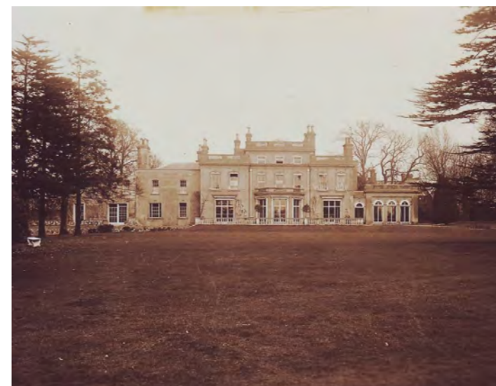
Lower Grove House, c1930. Demolished in 1935