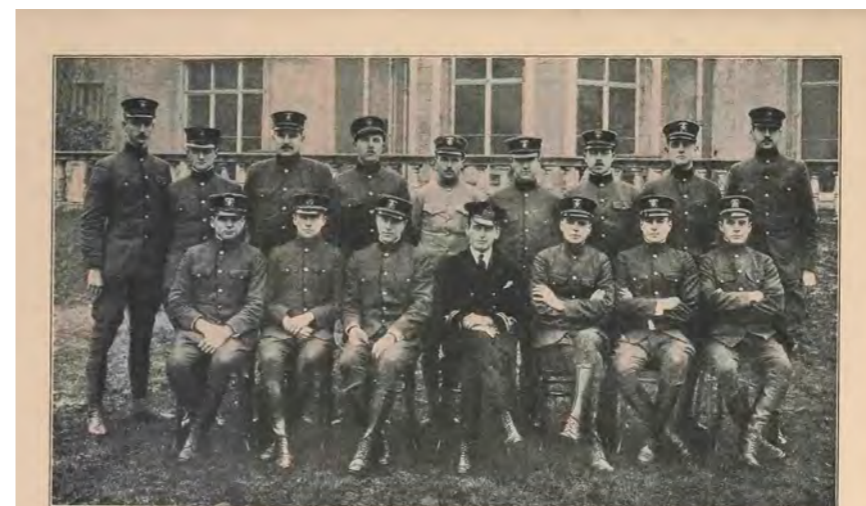
Fifteen aviators of the United States Naval Reserve Flying Corps outside Lower Grove House - 1917 (The officer in the centre is an Englishman)