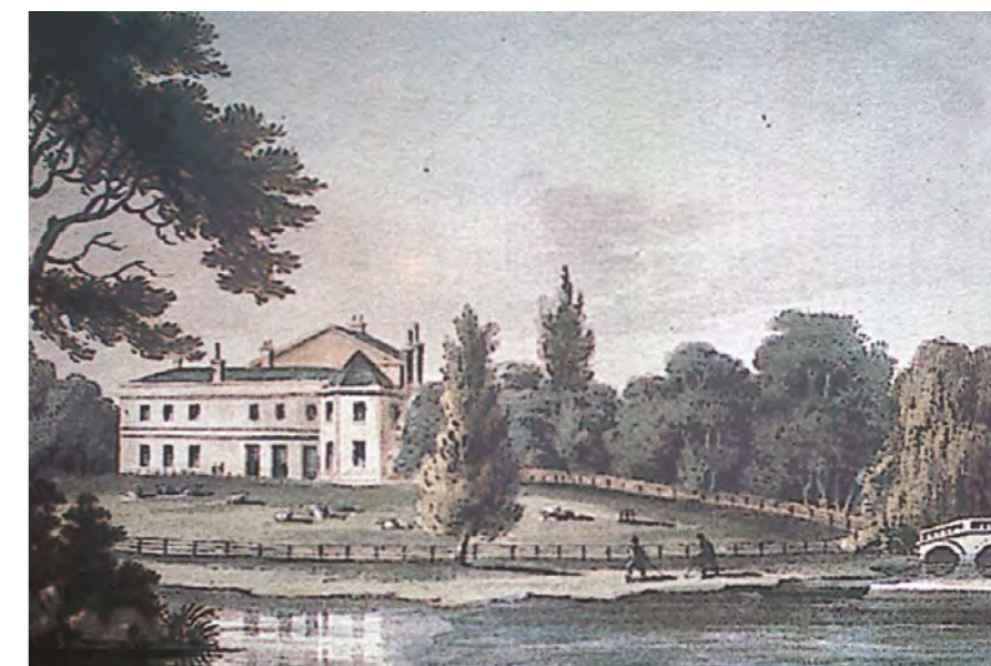
Roehampton Grove (Grove House), John Hassell - 1804

The estate was composed of two villas, Roehampton Grove House and Lower Grove House, and 144 acres of land. Roehampton Grove house was built on the foundations of a larger 17th Century villa, known as 'Roehampton Great House', built by David Papillon in the early 1620s. No picture of this house survives.