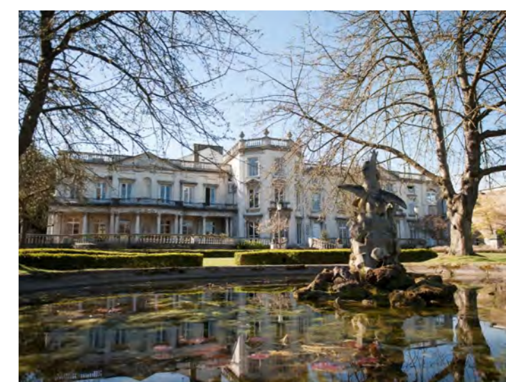
Grove House - 2018